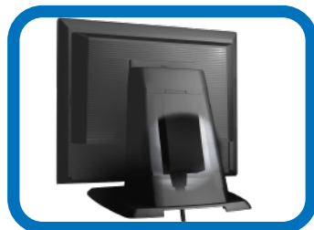
Power Adaptor Compartment