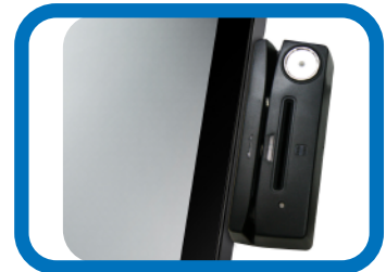
MSR / SCR and i-Button optional