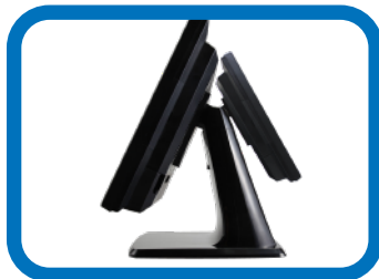
2nd LCD creates interactive display