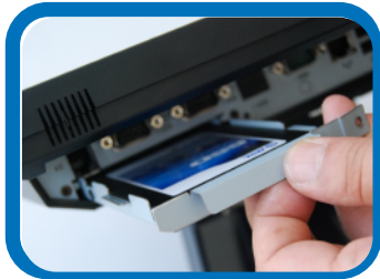
Easy storage maintenance design