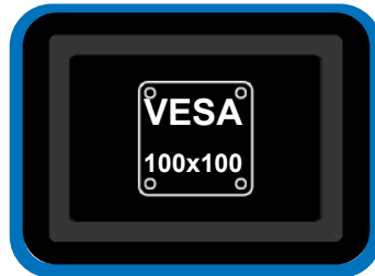
VESA for wall-mount