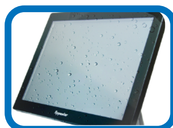
Splash-resistant on frontal